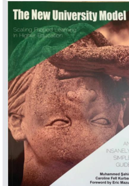
Second book April 2019