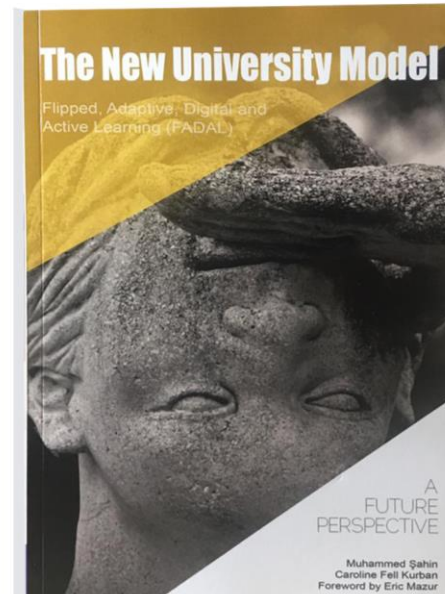
Third book July 2019